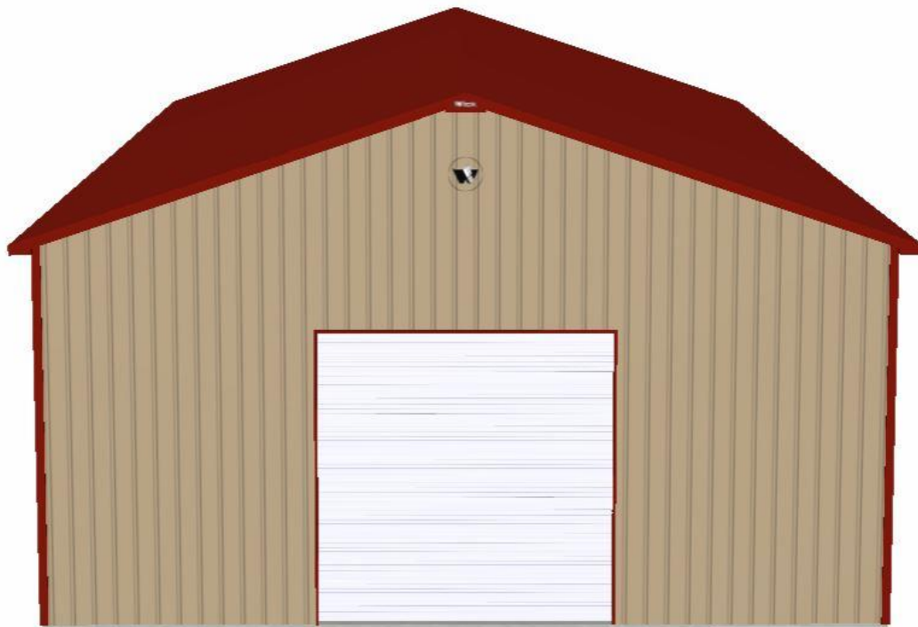
Size: 40' w x 80' l x 18' h