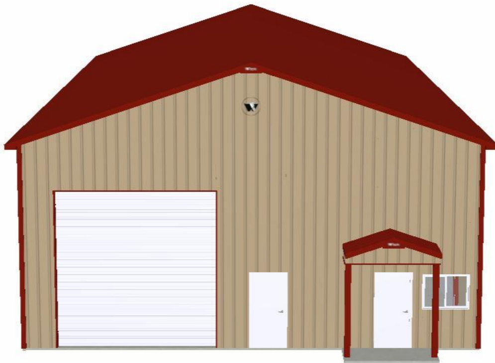
Size: 40' w x 80' l x 18' h