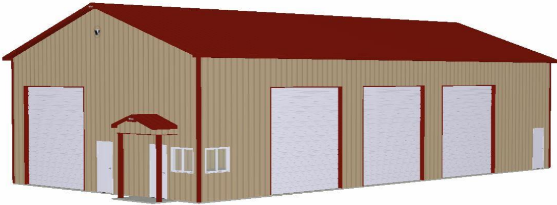
Size: 40' w x 80' l x 18' h