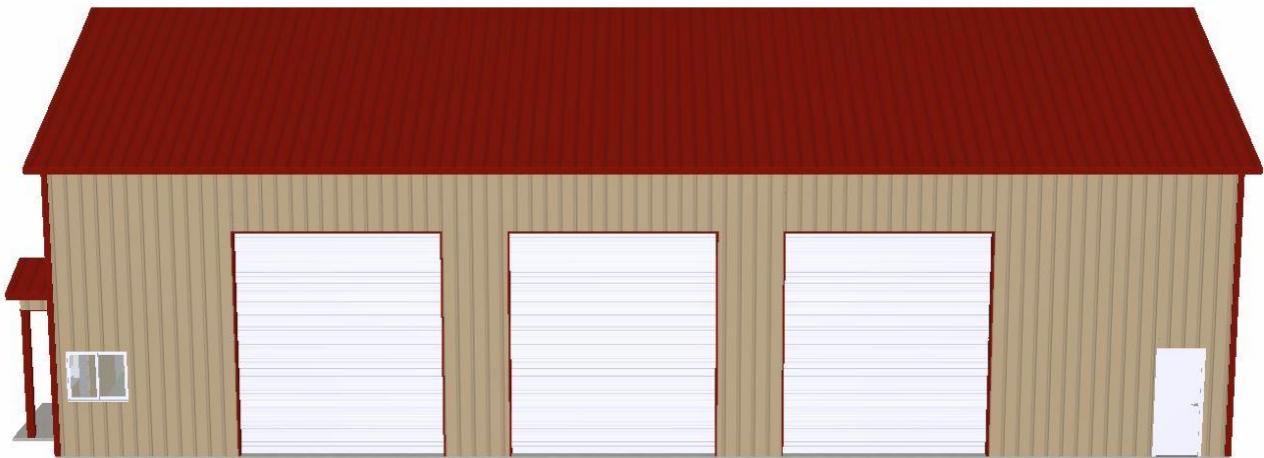
Size: 40' w x 80' l x 18' h