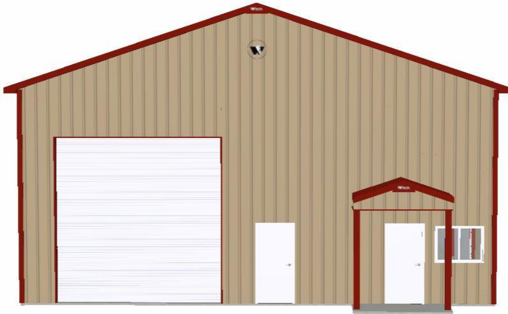
Size: 40' w x 80' l x 18' h